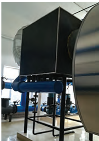
Boiler Energy-saving Device