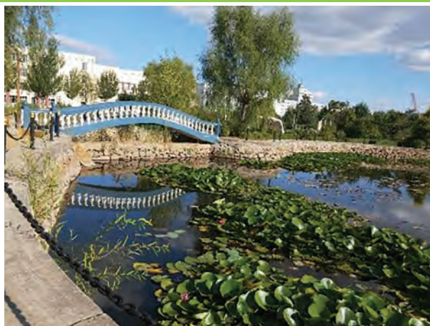
Mountain and Water Garden in Harbin Huade University (Northeast School)

During the reporting period, there were approximately 17,485 trees that are over 5m within the campus of Yunnan School, Guizhou School, Northeast School and Henan School. In accordance with the Appendix II: Reporting Guidance on Environmental KPIs of SEHK, a total of about 402 tons of carbon dioxide emissions can be offset in 2018, compared with 357 tons in 2017.